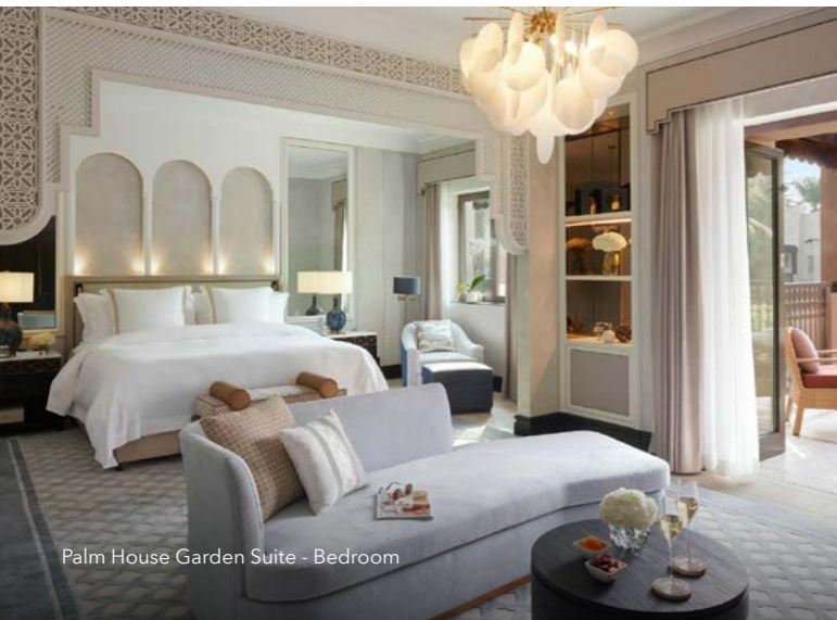
Palm House Garden Suite - Bedroom