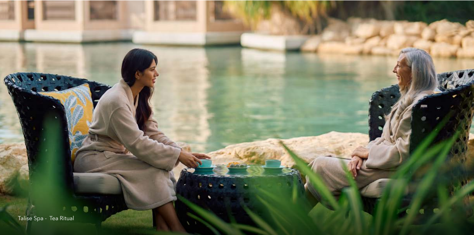
Talise Spa - Tea Ritual