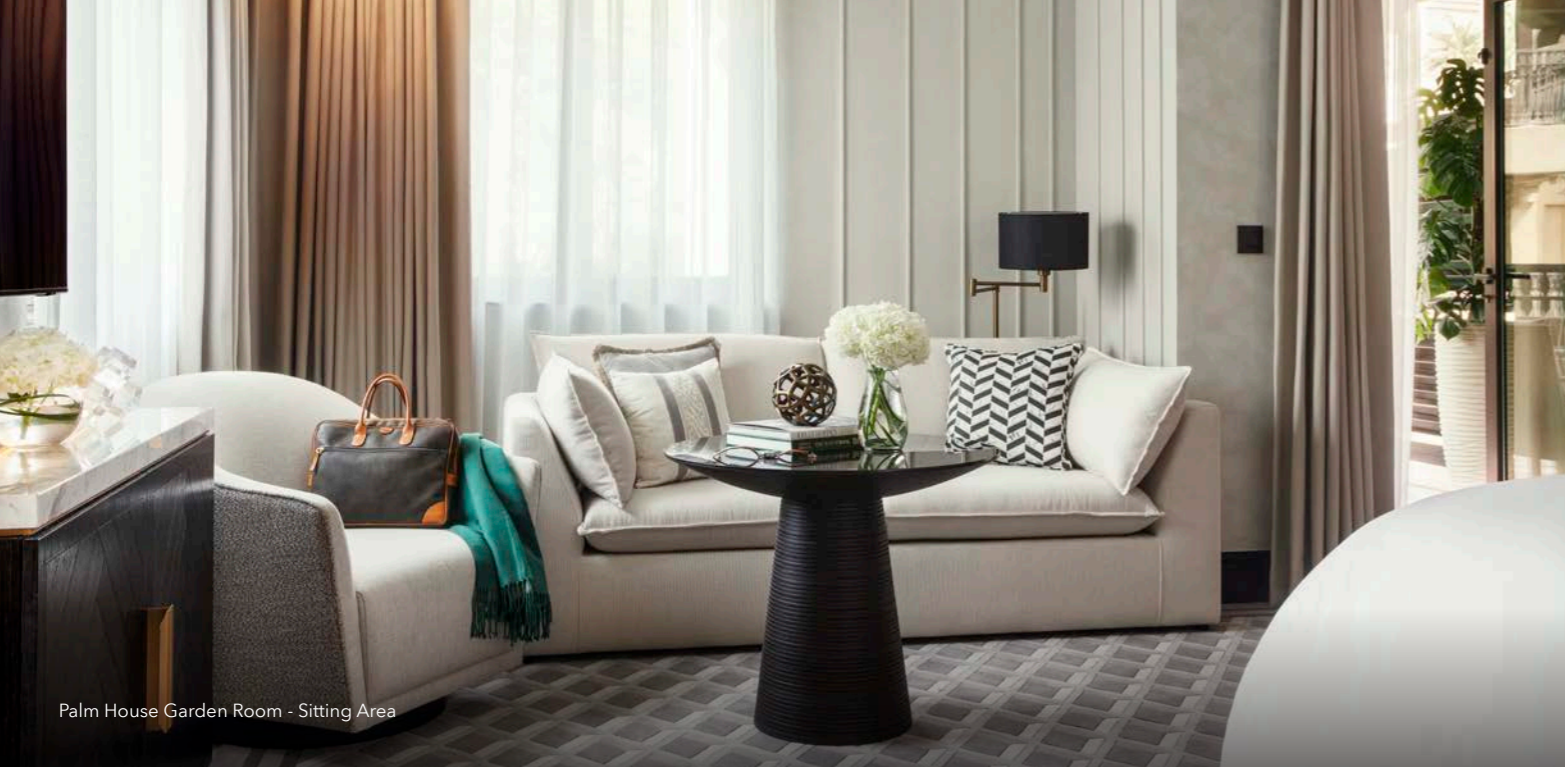
Palm House Garden Room - Sitting Area