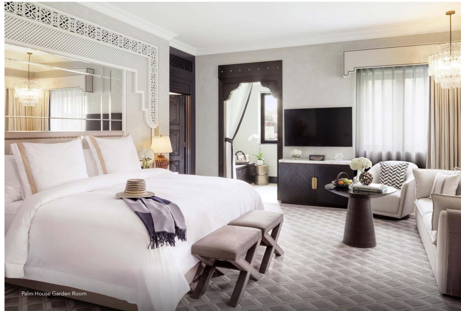
Palm House Garden Room

Step into the warmth of our Arabian Houses, resting along waterways and gardens.