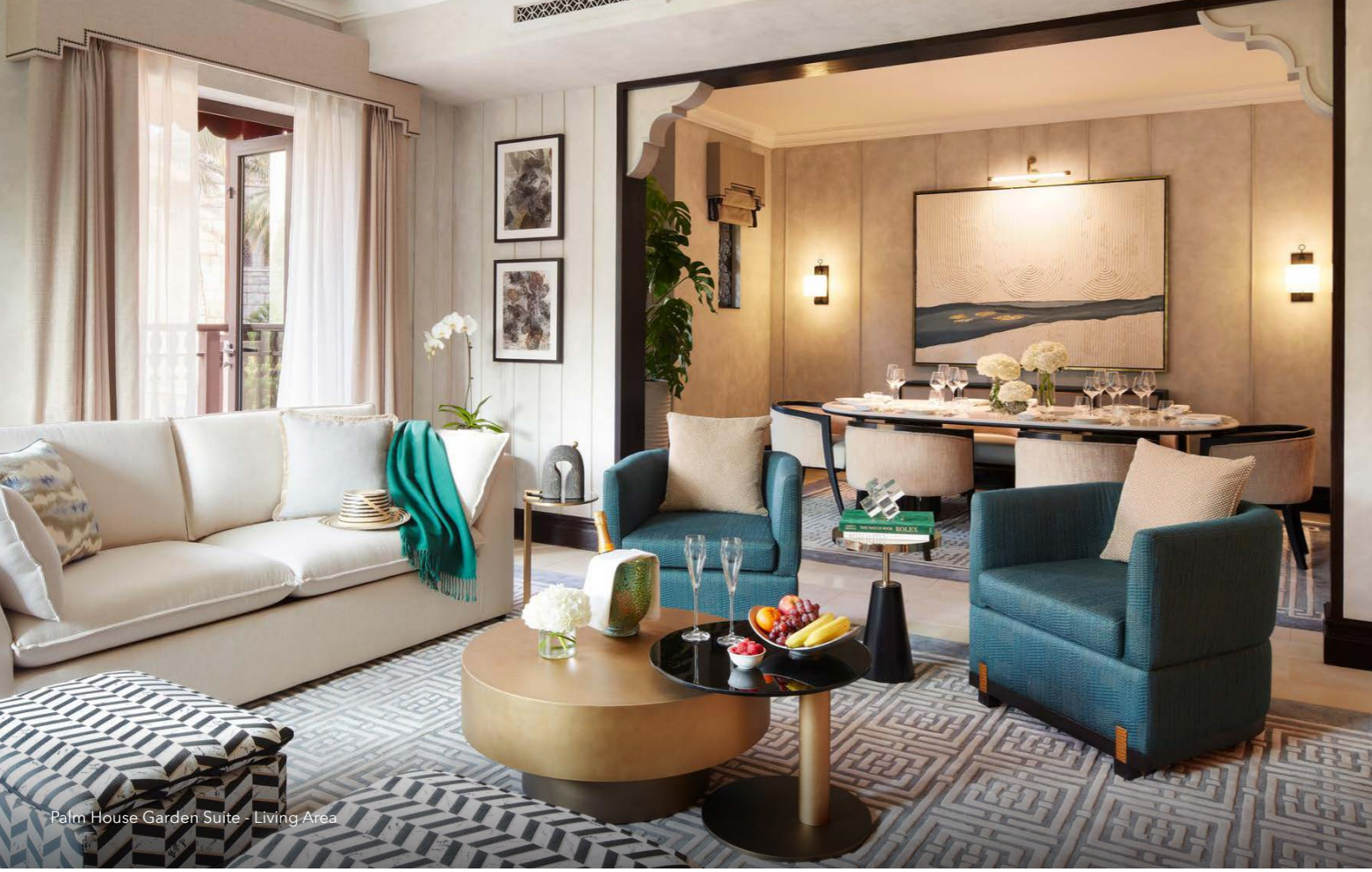
Palm House Garden Suite - Living Area