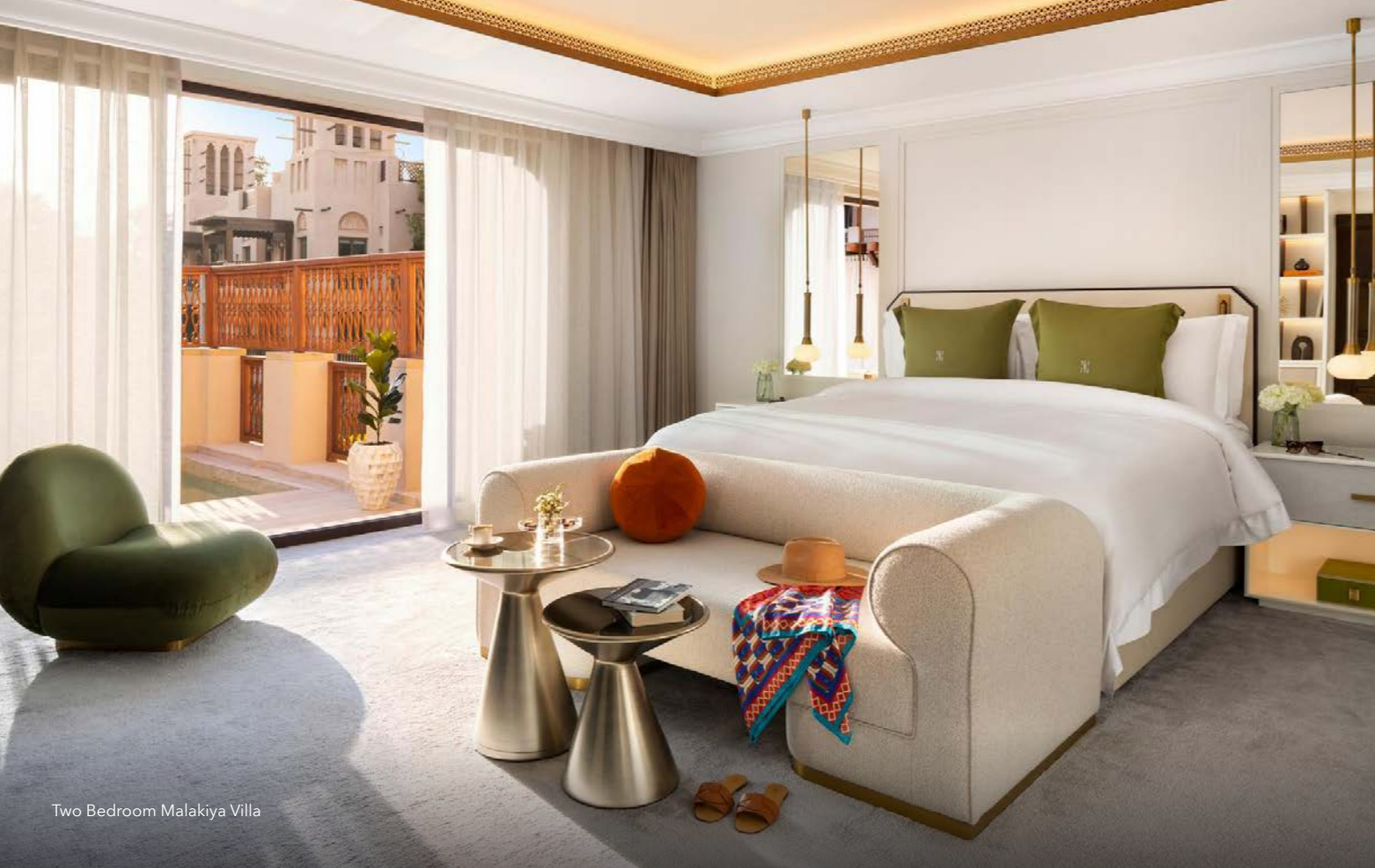
Two Bedroom Malakiya Villa