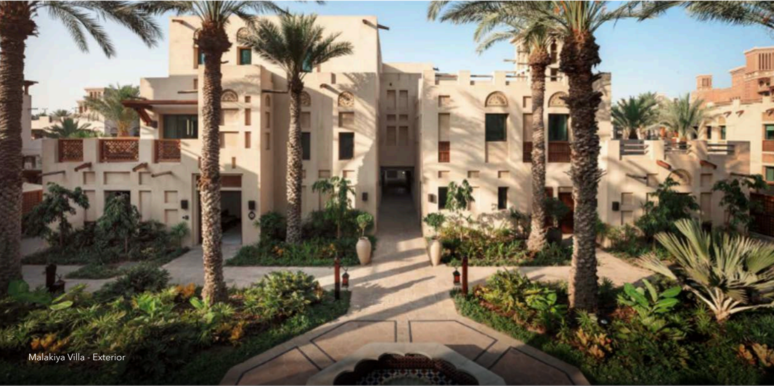
Malakiya Villa - Exterior