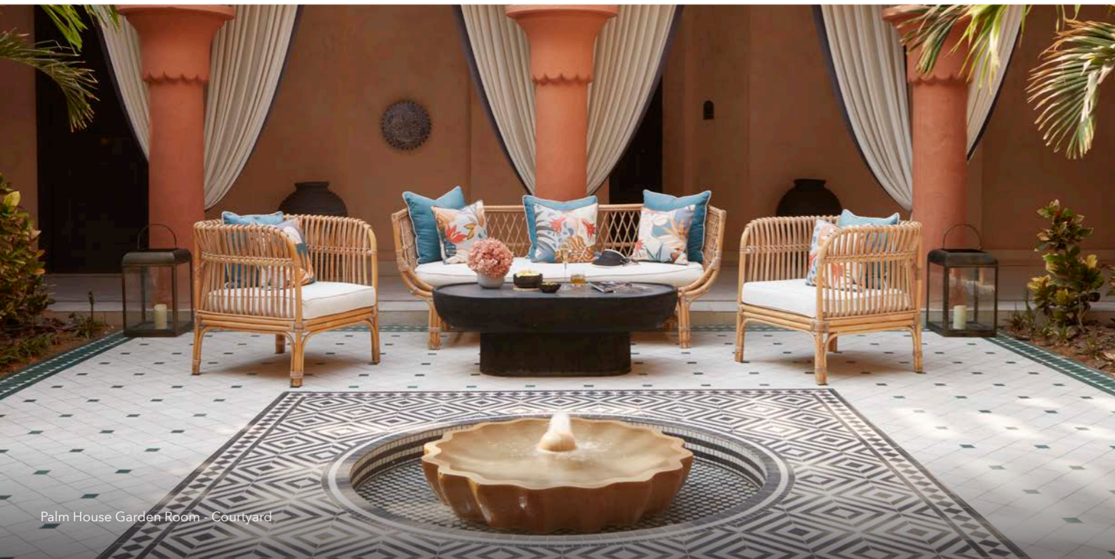
Palm House Garden Room - Courtyard

Each Arabian House is centred around a majlis - a cosy courtyard space with a private swimming pool. The authentic, charming majlis and courtyard each house a traditional mosaic fountain nestled within palm trees, welcoming guests with the soothing and magical aura of serenity.