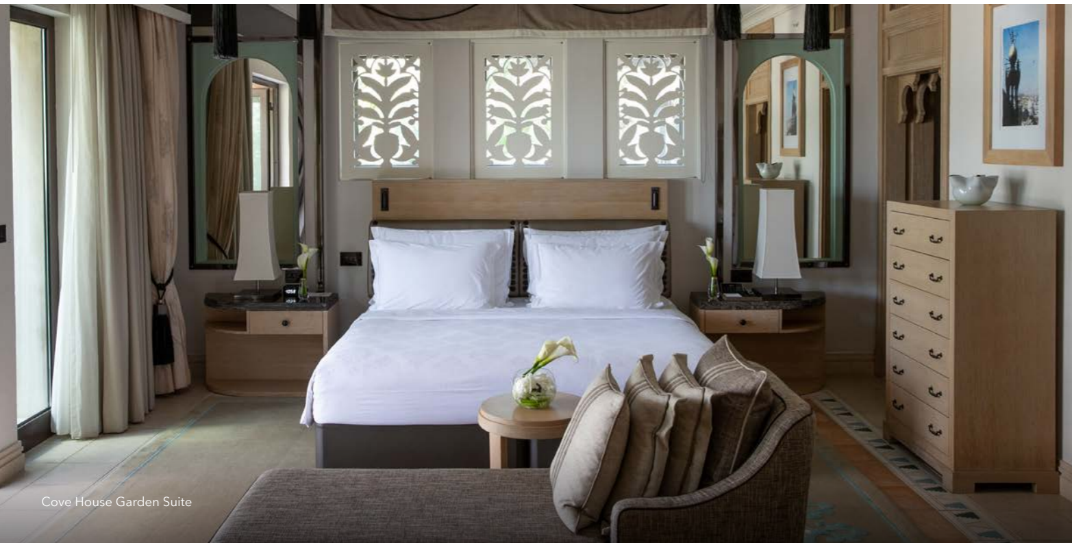
Cove House Garden Suite

Find serenity in our secluded oasis, surrounded by lush gardens.