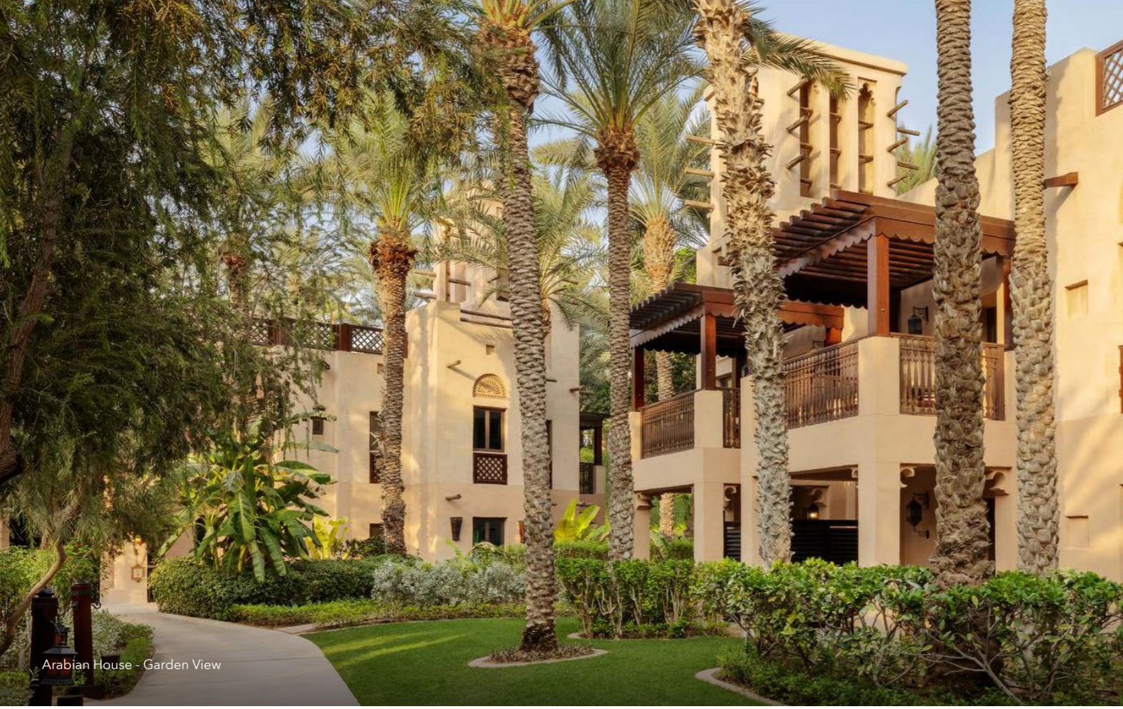
Arabian House - Garden View