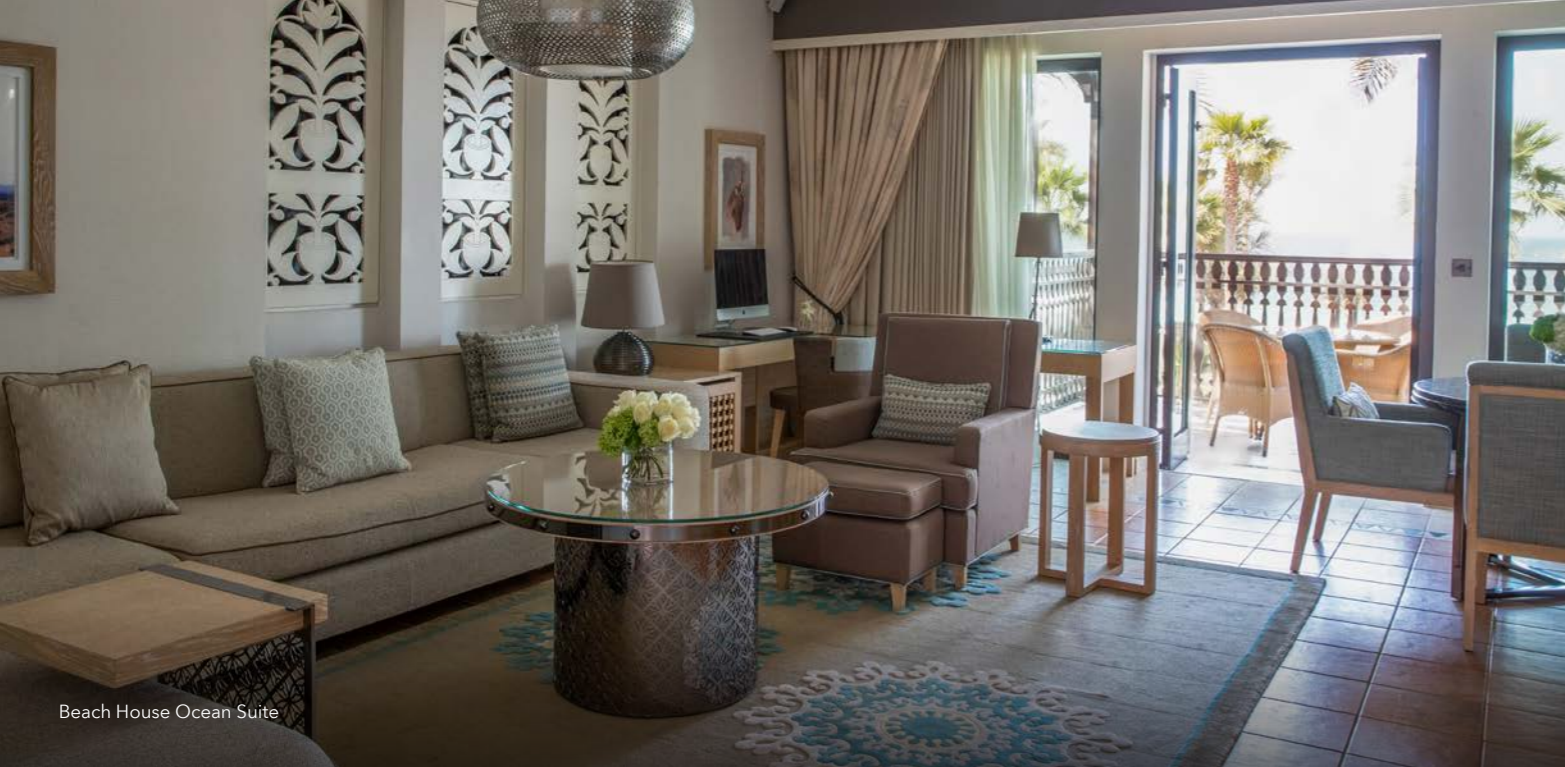
Beach House Ocean Suite