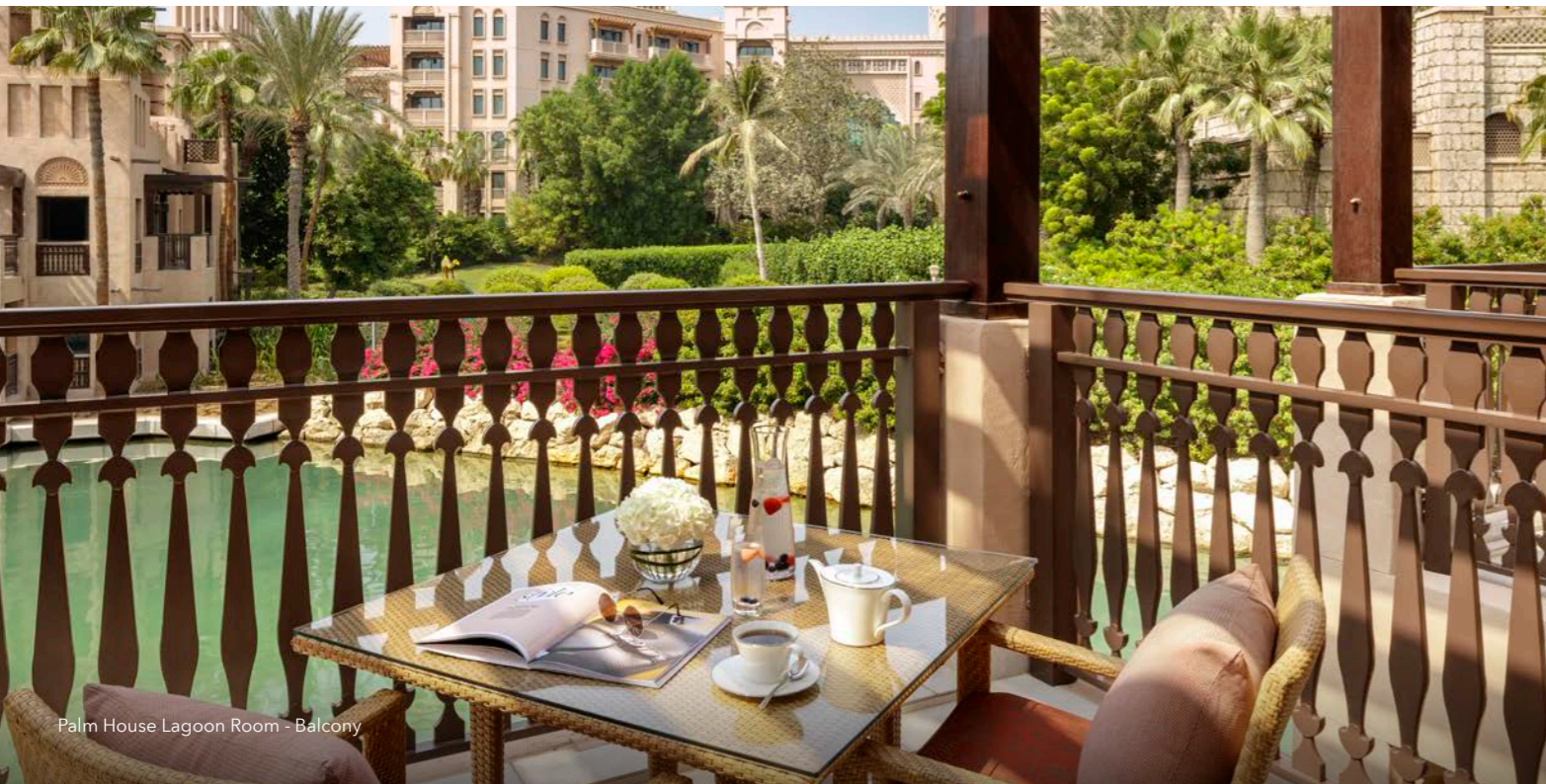
Palm House Lagoon Room - Balcony