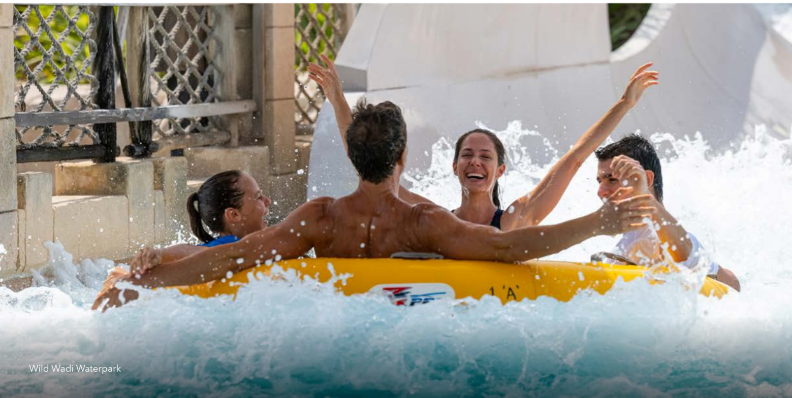
Wild Wadi Waterpark