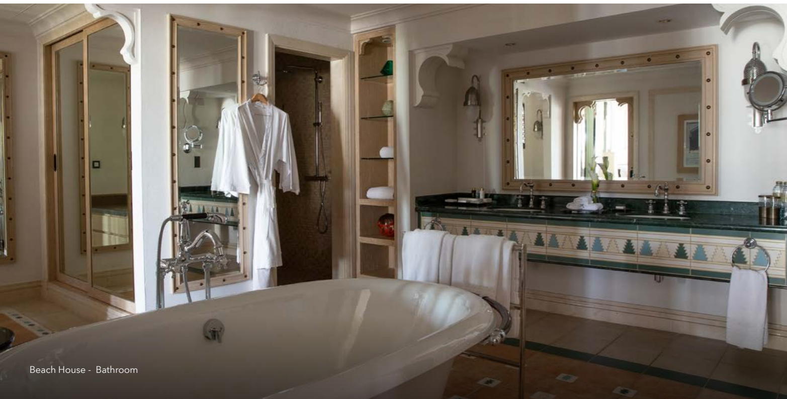
Beach House - Bathroom

Awaken to the sounds of the sea, moments away from the beach.