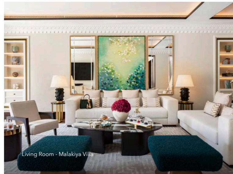
Living Room - Malakiya Villa