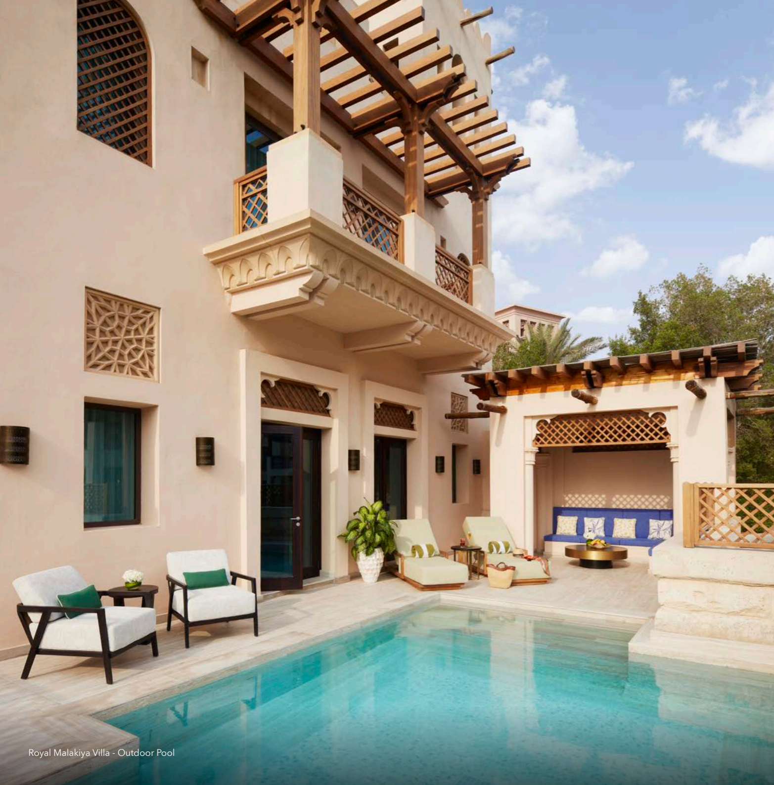
Royal Malakiya Villa - Outdoor Pool