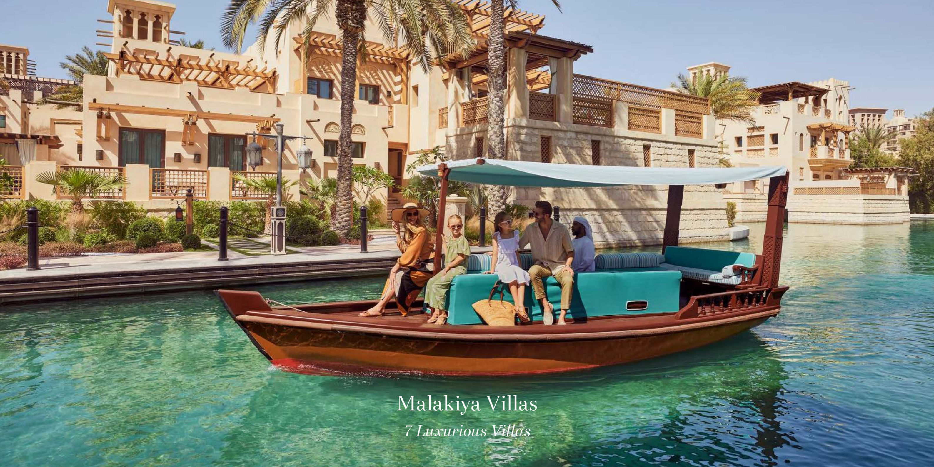
Malakiya Villas 7 Luxurious Villas