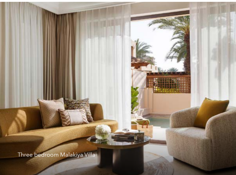
Three bedroom Malakiya Villa

The Ayla and Sama Villas, meaning moonlight and Sky, are ode to some of the region's most renowned literature and poetry, inspired by starry evenings in the desert. For VIP guests seeking a regal retreat, the Royal Malakiya Villa provides an opulent haven for a memorable holiday.