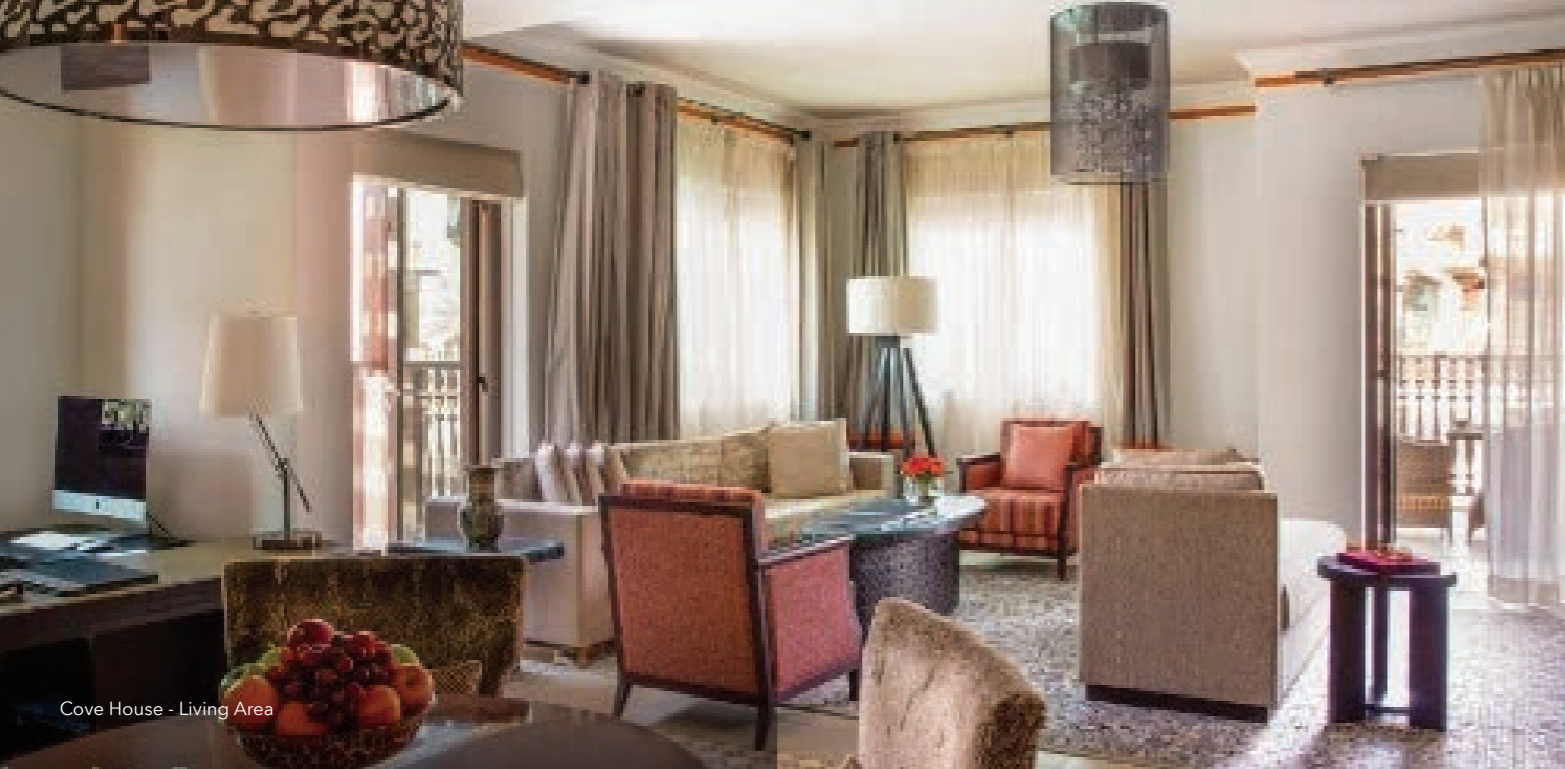
Cove House - Living Area