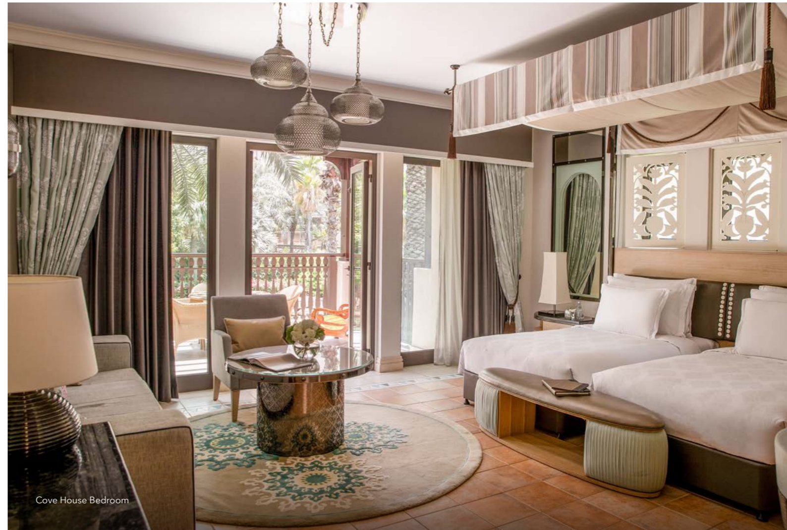
Cove House Bedroom