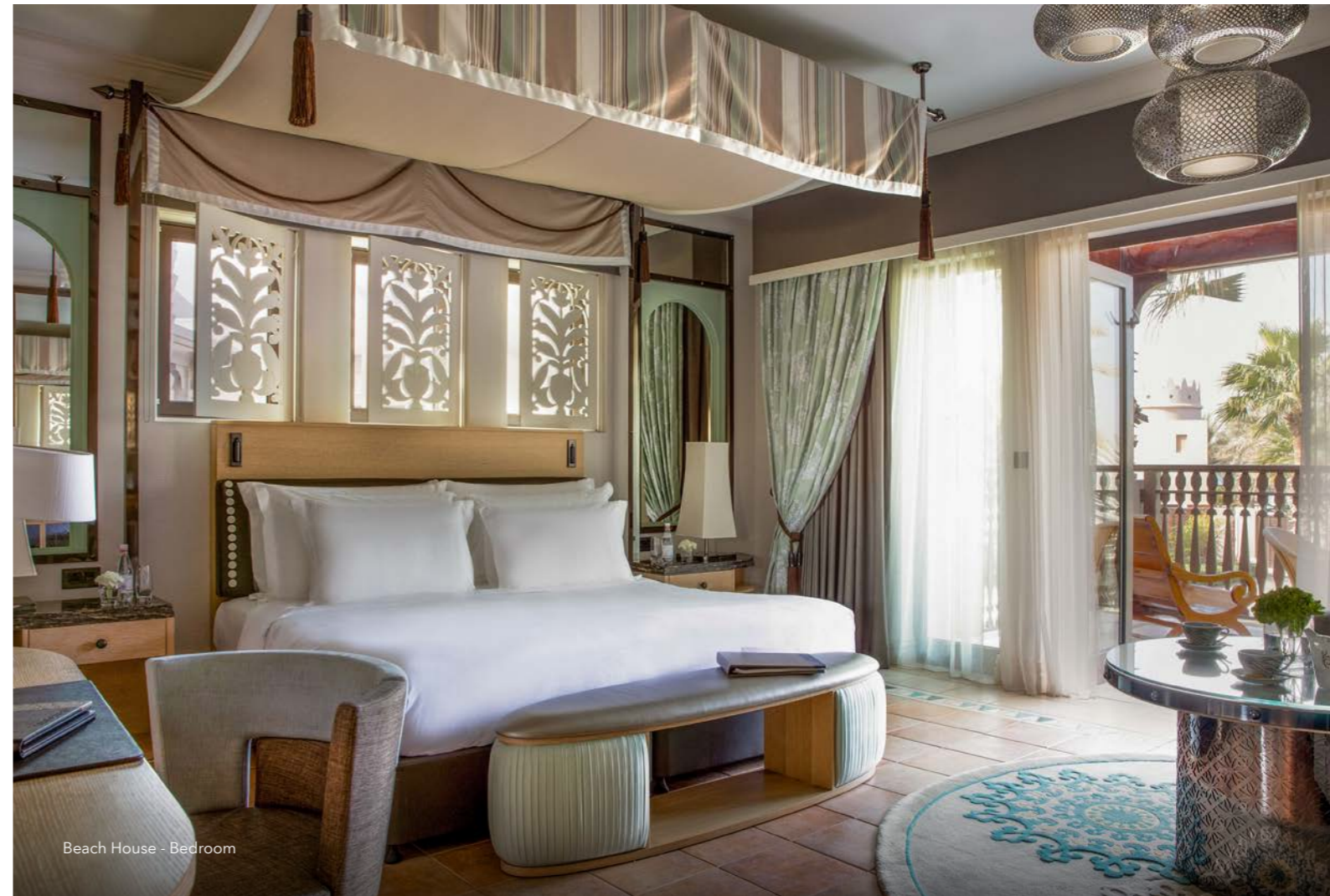
Beach House - Bedroom